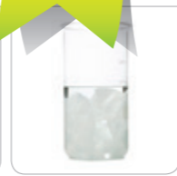
Ordinary toilet paper