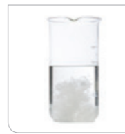
Aqua Soft toilet paper